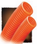
Corrugated HDPE (typically, multiple runs inside main conduit)