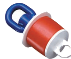
Expansion Type Duct Plugs (can be used with pull tape)