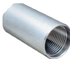
Universal Aluminum (screw-on type: sizes 1" thru 2")