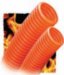
Riser Duct (for vertical runs in non-air handling spaces)