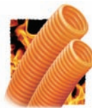
Plenum Duct (for horizontal runs, or where vertical runs are inside air-handling spaces)